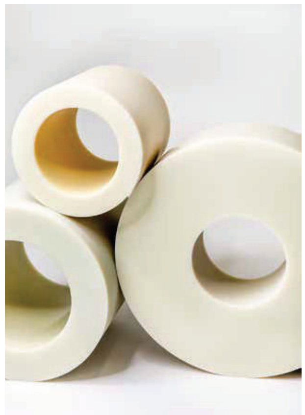
Data: weight in kg for D/d × 1000 mm